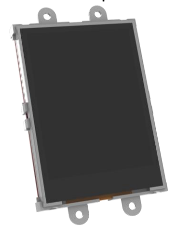
The uLCD-24-PTU Display Module